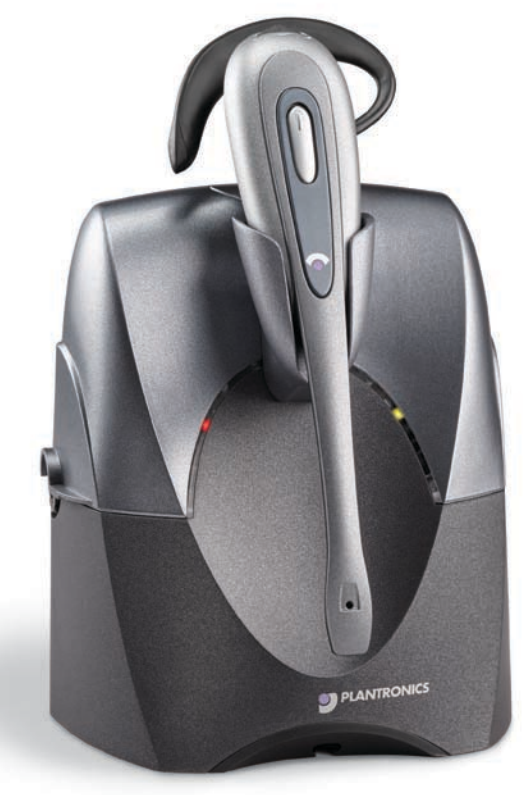
>> CS60 Wireless Office Headset System, shown with accessory HL10 Handset Lifter

*Requires HL10 Handset Lifter sold separately.